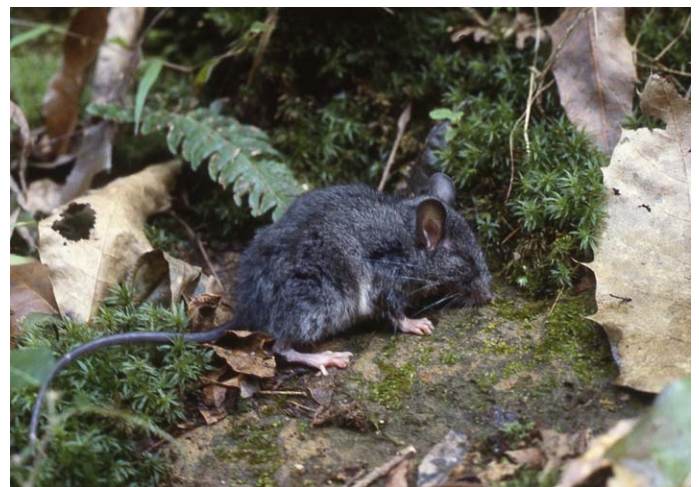
Fig. 1. —An adult female Peromyscus fuvvus from 5 km SE Jalapa, Veracruz, México.

Peromyscus fuvvus (Fig. 1) is one of the larger members of the genus Peromyscus (total length of adults rarely < 250 mm and greatest length of skull usually > 32.0 mm). Cranial features (Fig. 2) of Peromyscus are: "Skull very large in comparison with the external measurements of the animal, and very strong and heavy for a Peromyscus " (Allen and Chapman 1897:202). Skull is very similar to other members of the genus Peromyscus except for the rostrum, which is "very broad, inflated anteriorly, and distinctly bell-shaped, the breadth across the tip of nasals,