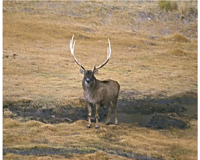
Fig. 5. —Male Przewalskium albirostre standing near a muddy wallow in Qilian Mountains, northeastern Qinghai; mature males seek out such wet wallows, a behavior that departs from some other large deer species.

Yu et al. (1993) provided the following details on behavior of female P. albirostre during parturition. Females separate themselves from other females and seek secluded places to give birth and hide their neonates. Among 37 birthing sites in Sichuan, 46% occurred in Rhododendron