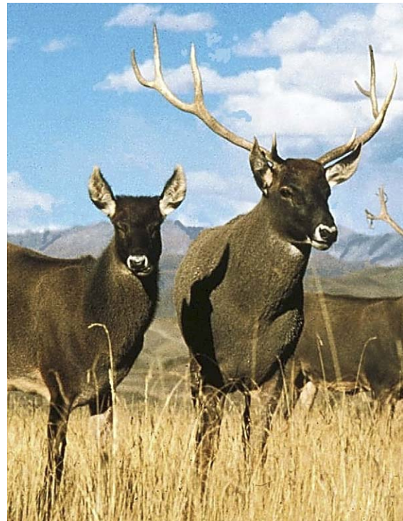
Fig. 1. —Mature female (left) and male Przewalskium albirostre in northeastern Tibet, China; note diagnostic features including white muzzles, inner ears, and chins; heads darker than bodies; pointed ears; and distance between the 1st and 2nd tines on the male’s antlers and uniform plane of the tines.

Cervus thoroldi Blanford, 1893:444, pl. 34. Type locality “about 200 miles N.E. of Lhasa [= Lhasa],” Tibet, China.