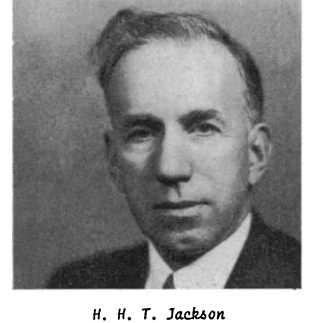
Presidents of the American Society of Mammalogists