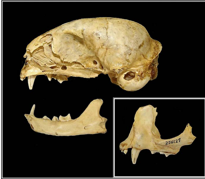
Fig. 3. —Lateral views of skull (top) and mandible (bottom) and broken piece of premaxillae–nasal and partial orbit (inset) of male Leopardus braccatus ; United States National Museum of Natural History, specimen 256127, labeled Oncifelis colocolo braccata , locality “Brazil: Mato Grosso, Descalvados, Upper Paraguay River,” collected by F. W. Miller, 29 November 1925 (see Miller 1930).

Lujanian (0.5 million–8.5 thousand years ago) localities in the Pampean region of Argentina (Prevosti 2006). A fossil of L. colocolo also was found in Tierra del Fuego, Chile, an island not currently inhabited by felids, and thought to be as young as the late Pleistocene or early Holocene (Prevosti 2006). L. colocolo split from the common ocelot ancestor about 1.7 million years ago, based on molecular estimates (Johnson et al. 1999). A fossilized left humerus identified as L. braccatus from the late Pleistocene–early Holocene recently was found in Serra da Bodoquena, Mato Grosso do Sul, Brazil, near the type locality (Perini et al. 2009).