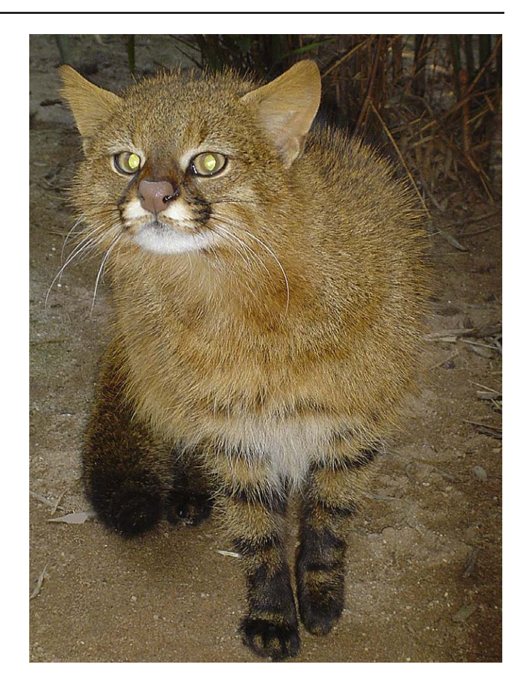
Fig. 1. — Leopardus braccatus munoai exhibited as gato palheiro (= Leopardus colocolo ) at Zoológico del São Paulo.

Oncifelis Severtzov, 1858:386. Type species Felis geoffroyi d'Orbigny and Gervais, 1844, by monotypy; proposed as a subgenus of Felis Linnaeus, 1758.