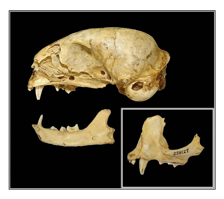
Fig. 3. —Lateral views of skull (top) and mandible (bottom) and broken piece of premaxillae—nasal and partial orbit (inset) of male Leopardus braccatus ; United States National Museum of Natural History, specimen 256127, labeled Oncifelis colocolo braccata , locality "Brazil: Mato Grosso, Descalvados, Upper Paraguay River," collected by F. W. Miller, 29 November 1925 (see Miller 1930).

Lujanian (0.5 million–8.5 thousand years ago) localities in the Pampean region of Argentina (Prevosti 2006). A fossil of L. colocolo also was found in Tierra del Fuego, Chile, an island not currently inhabited by felids, and thought to be as young as the late Pleistocene or early Holocene (Prevosti 2006). L. colocolo split from the common ocelot ancestor about 1.7 million years ago, based on molecular estimates (Johnson et al. 1999). A fossilized left humerus identified as L. braccatus from the late Pleistocene–early Holocene recently was found in Serra da Bodoquena, Mato Grosso do Sul, Brazil, near the type locality (Perini et al. 2009).